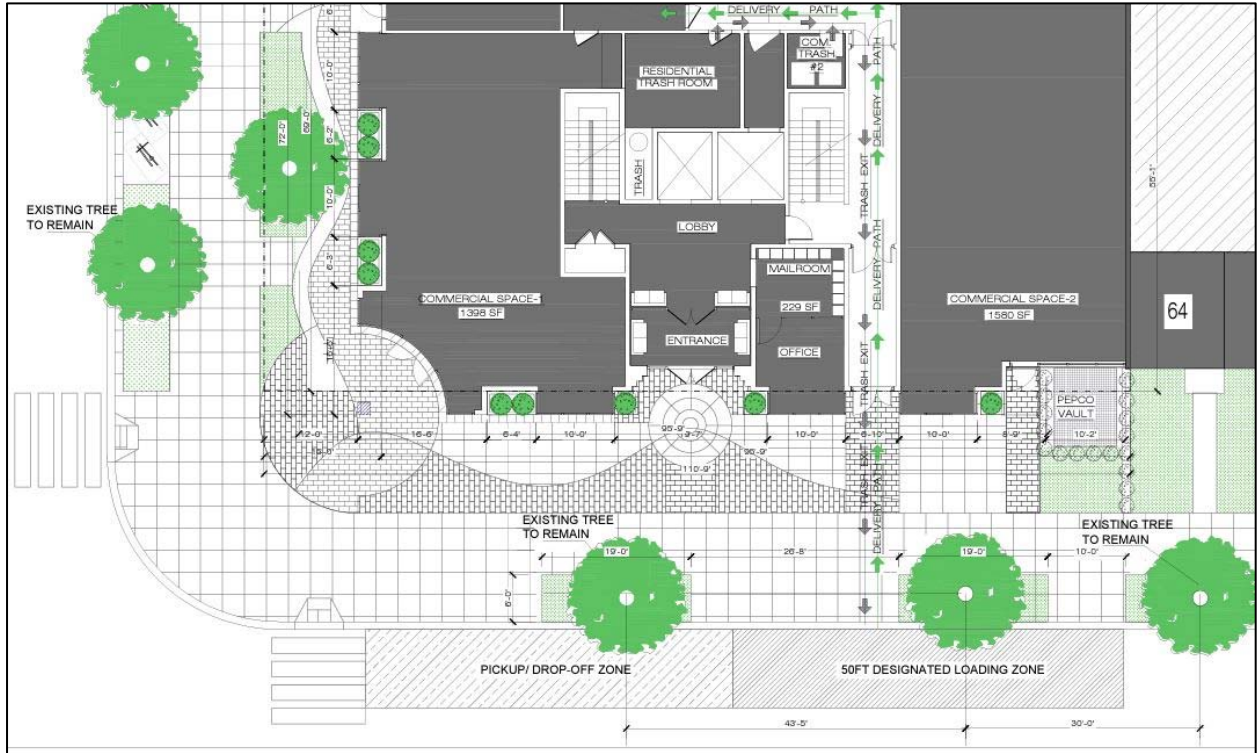
9/19/22, Exhibit 42A1